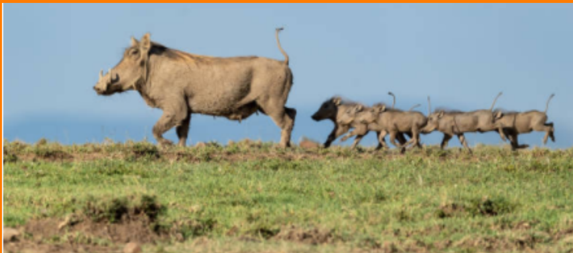
MOM and the kids ...

We never know what we'll see as our guides take us around the many Reserves we'll visit. Have your cameras ready! ... and don't forget to have some one take YOUR picture as you experience what may be a "Once In A Lifetime" adventure for you!