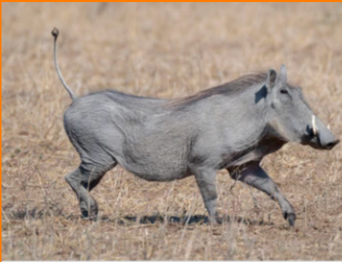
The Kenyan Express in action.